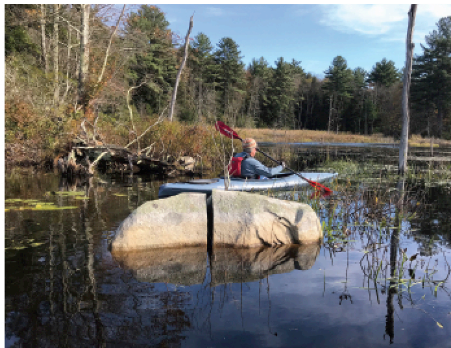
photo below : New Chesterfield town rep. Carl Cignoni paddles the stunning Fisk Meadows. off route 143 in Chesterfield MA.