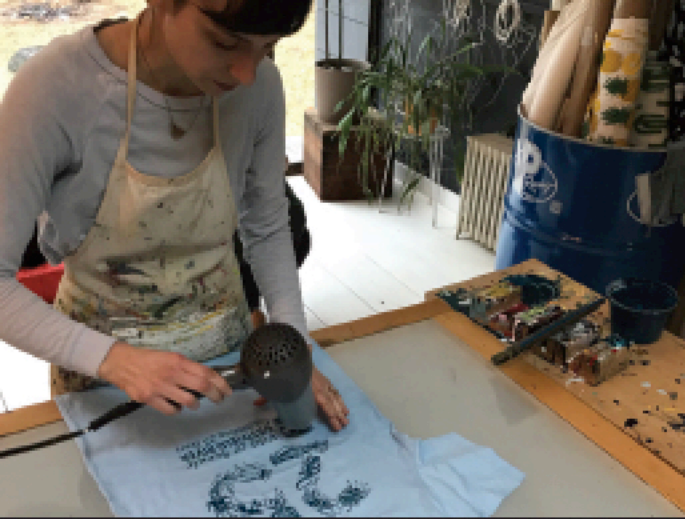
Moho Design in Great Barrington creates our 25th anniversary organic tee shirts