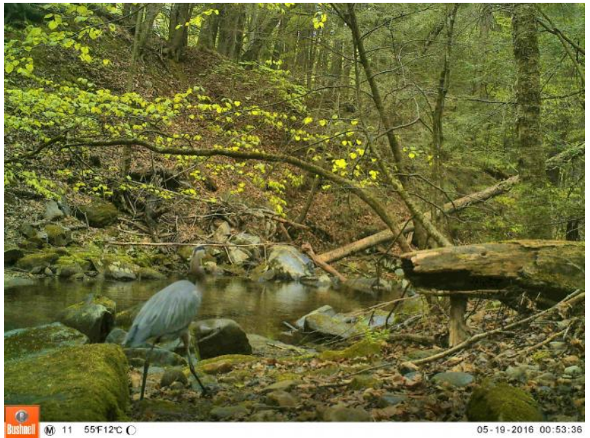
Blue Heron along Watts Stream in Worthington

Setting up the wildlife camera in her backyard, a small haven adjacent to Watts Stream nicknamed Frog Hollow, she was amazed by the number and diversity of critters who would visit the stream. “It feels like Christmas. I was glad to see so much action down there. I was afraid our presence would scare off all the creatures. I guess not!”