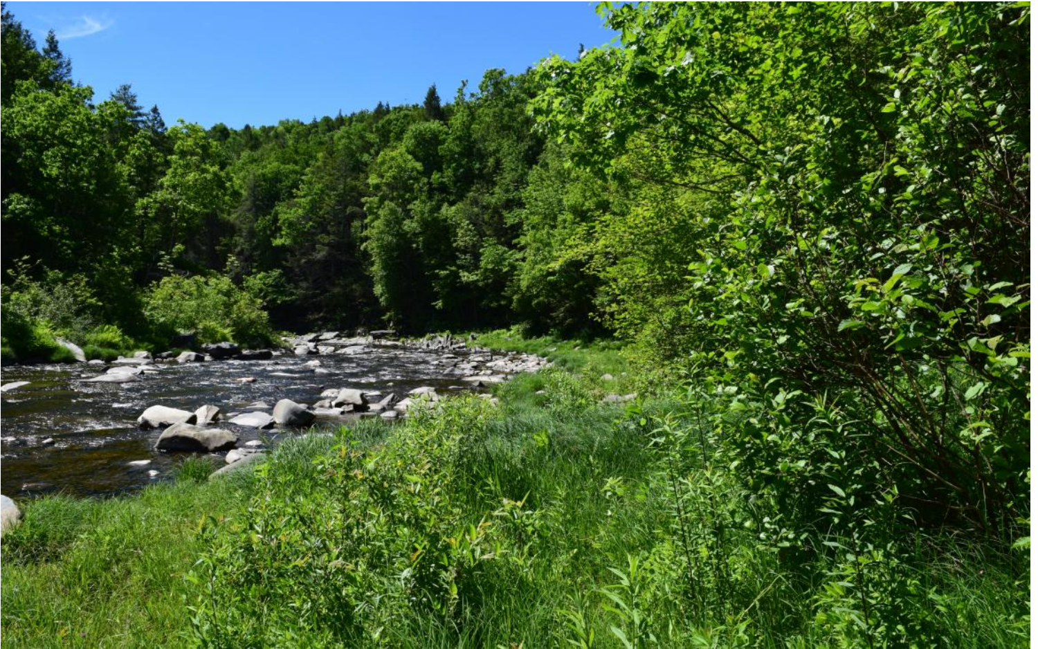
East Branch of the Westfield River in Chesterfield.