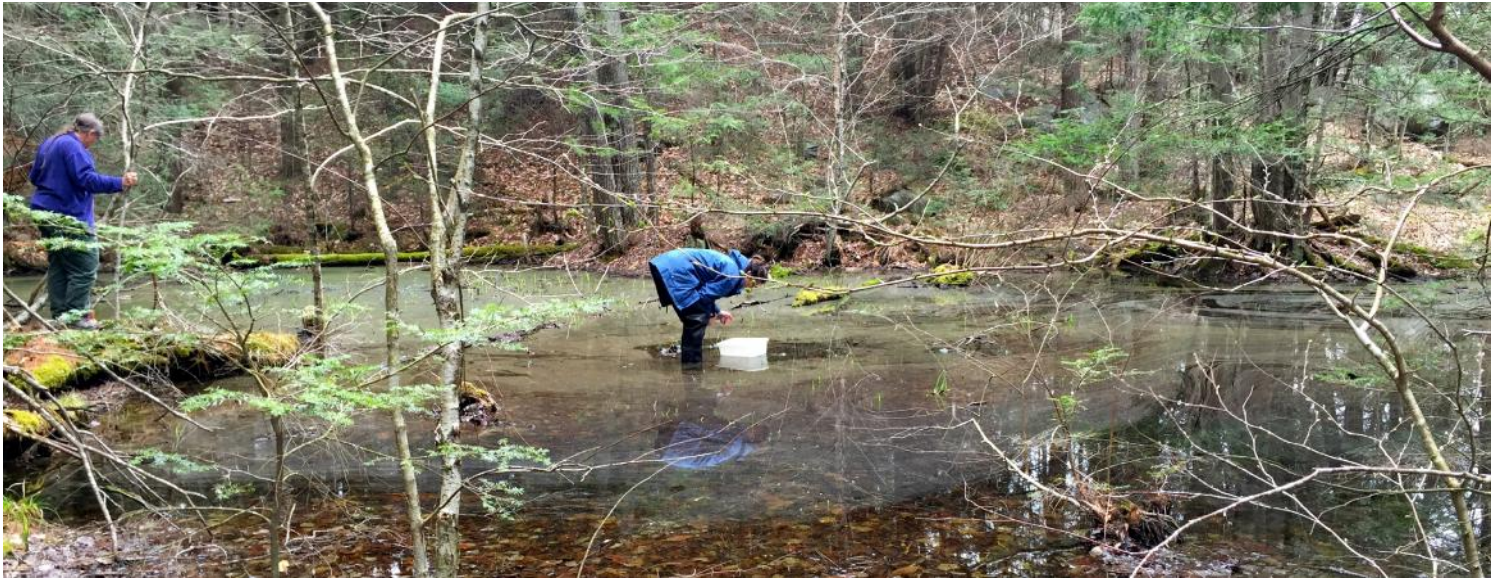
Vernal pool in Middlefield.