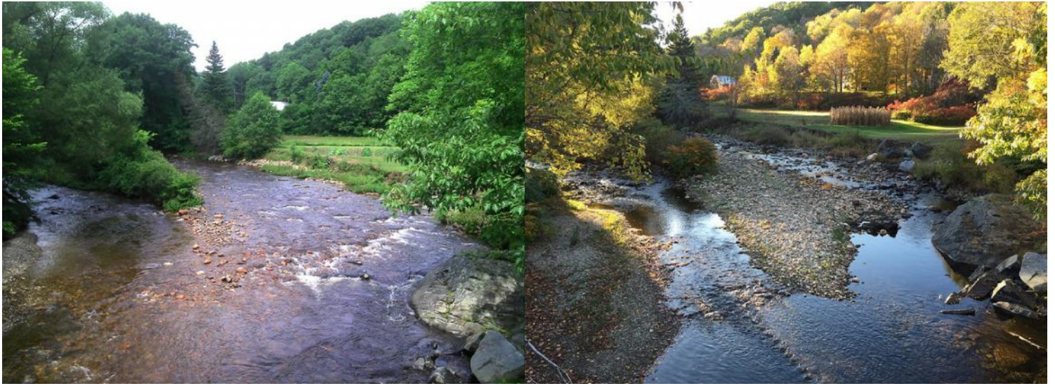
East Branch of the Westfield River in Cummington July 2014 (left) and September 2016 (right).